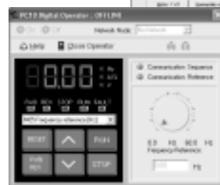
Digital Operator Panel

Please visit our Web site at www.saftronics.com and try out a demo version.